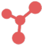
Peptides and Proteins